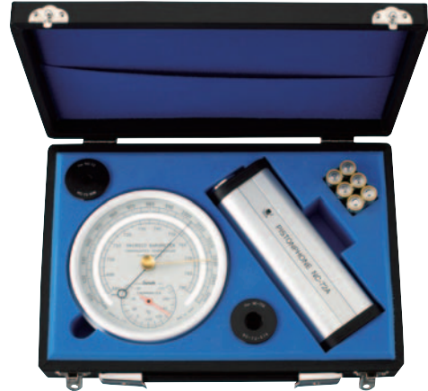
Carrying case (supplied)

NC-72A is designed to generate sound that has a sound pressure level of 114 dB(nominal) at 101.325 kPa of atmospheric pressure. Depending on the barometric pressure, the unit may need compensation. For this purpose, a barometer is supplied with the unit.