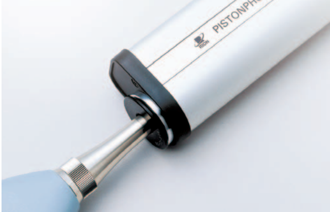
Usage example (NL series)

Carefully insert the microphone all the way into the coupler. Then simply turn the power on to apply a constant sound pressure level to the diaphragm of the microphone. The 1/2 and 1/4 inch microphones can be used after the supplied adaptor is installed in the coupler.